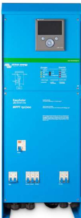
EasySolar 5 kVA

http://www.victronenergy.nl/support-and-downloads/software/