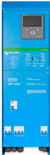
EasySolar 3 kVA